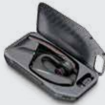
Charging case (Sold separately)