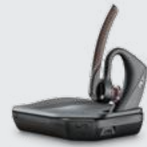
Charges while docked